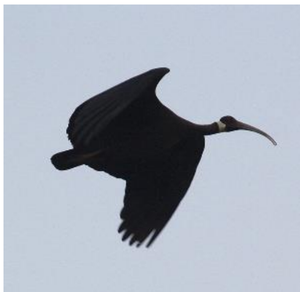
The critically endangered White-shouldered Ibis will be, along with Giant Ibis, amongst our primary targets at Tmatboey.

This morning, we must depart early in order to reach a very attractive area of grasslands with scattered small pools called Prolay. This very important and surprisingly bird-rich habitat supports arguably the world's single largest population of the endangered Bengal Florican. This striking and aberrant member of the bustard family is declining rapidly due to continuing loss of its grassland habitat throughout its global range. Here the floricans are well protected and we have an excellent chance at multiple encounters with the flamboyant males. Undoubtedly the contribution we make through our donation, which is paid directly to the villages, goes a long way towards long-term protection of these lands. Other birds we may encounter during our florican search include Woolly-necked and Painted storks, Greater Spotted Eagle, Small Buttonquail, Pied and Eastern Marsh harriers, Blue-tailed Bee-eater, Lanceolated Warbler, Siberian Rubythroat, Bluethroat and the endangered Manchurian Reed-Warbler. From Prolay we will head north, gradually working our way into extensive areas of dry dipterocarp forest. This is a bird-rich habitat that supports a tremendous diversity of birds. These forests are home to some of the healthiest populations of Asian endemics such as Rufous-