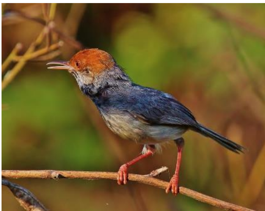
The Cambodian Tailorbird is one of the most recently described birds in the world.

NIGHTS: Nature Lodge Resort, Sen Monorom