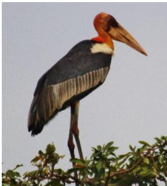
Another critically endangered Asian wetland species Cambodia is quite famous for—the superb Greater Adjutant photographed at Tonle Sap